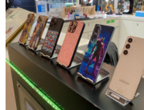
Mobile phone coating